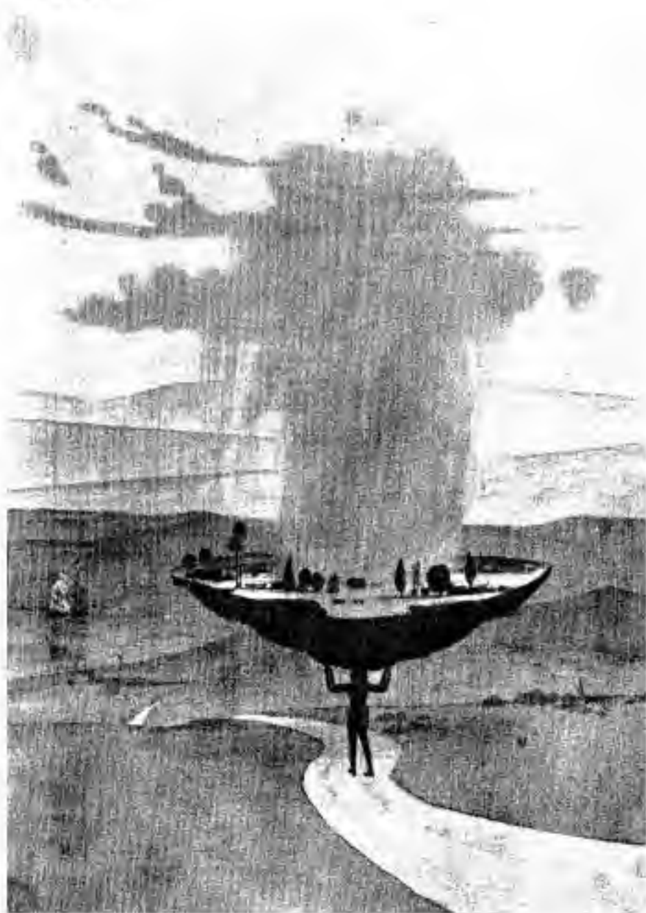
"My ancestor went about in search of rain."